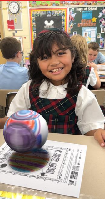
Student working with Virtual Reality